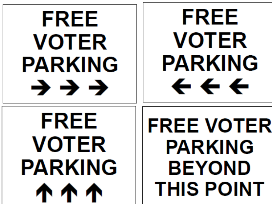
Free Voter Parking Signage

Arrangements will also be made for the message 'Free Designated Parking For Voters' (or similar) to be printed on affected electors' poll cards and for the following additional signage to be procured and erected at Parklands to signpost the free designated parking areas.