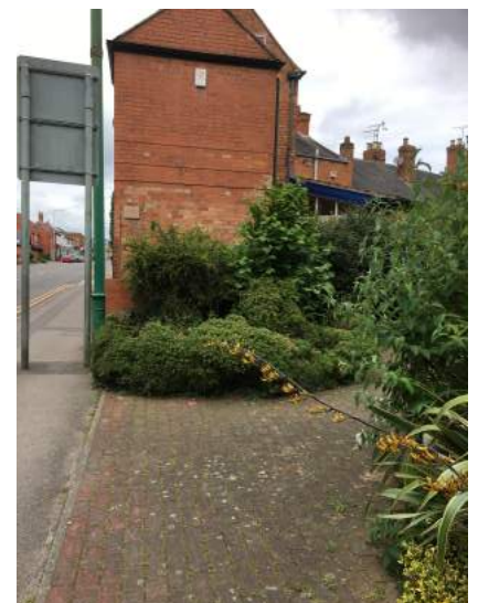
Attractive mature and well-maintained front garden which shields the garden from the road, and with seating